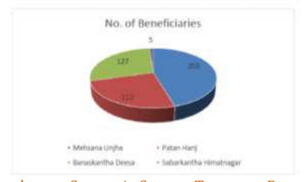
Shri Brahma Samaj Seva Trust, Patan